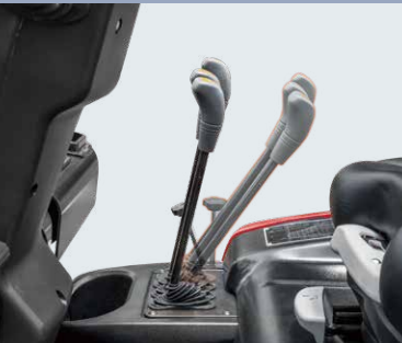
Cover can be easily opened by adjusting the levels forward