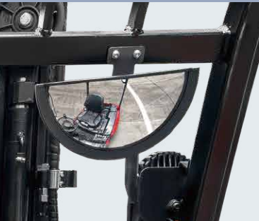
Panoramic rearview mirror