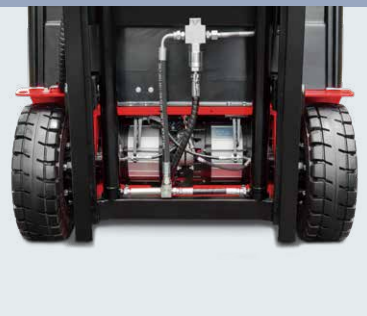
Front dual separated motors