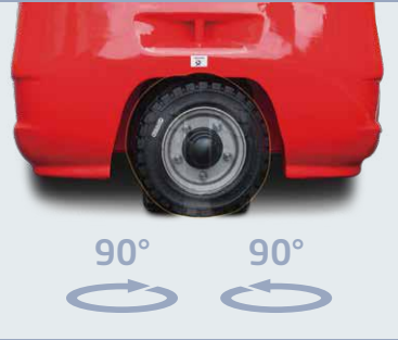
The small turning radius is suitable for narrow channel